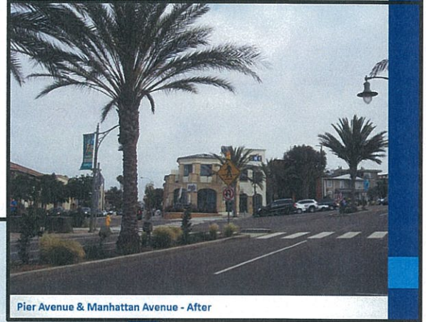
Pier Avenue & Manhattan Avenue - After