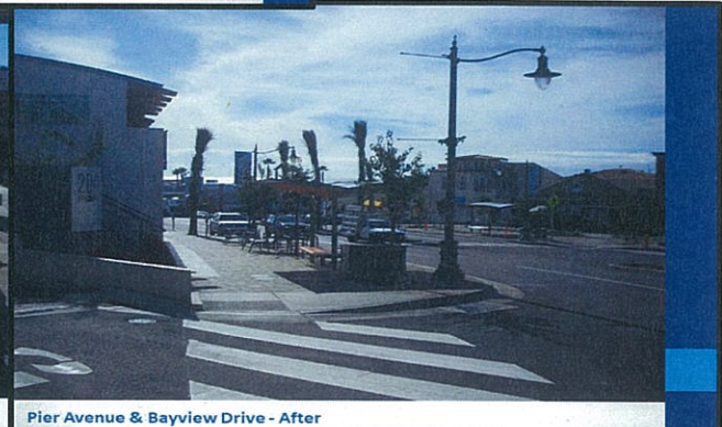
Pier Avenue & Bayview Drive - After