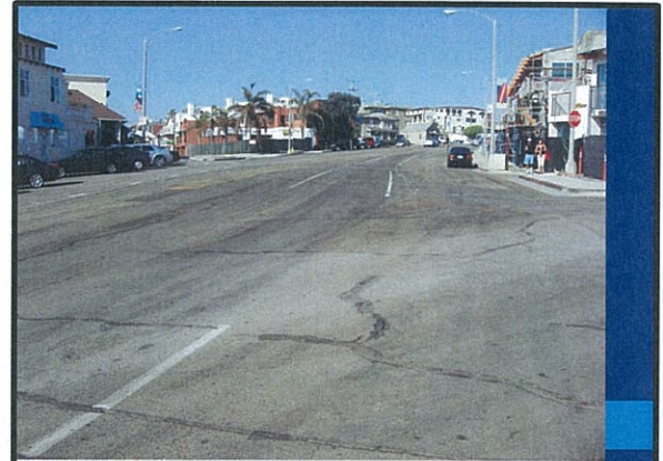
Pier Avenue & Manhattan Avenue - Before