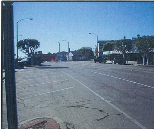
Pier Avenue & Loma Drive - Before