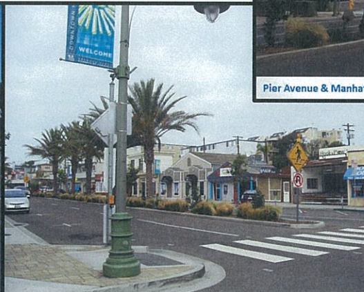
Pier Avenue & Loma Drive - After