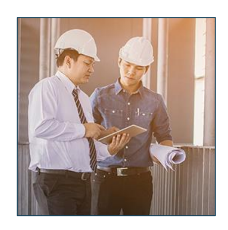
Project Delivery Program