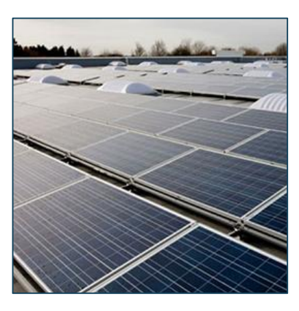
Pathway to Zero