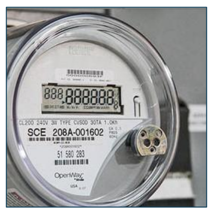
Metered Savings Program