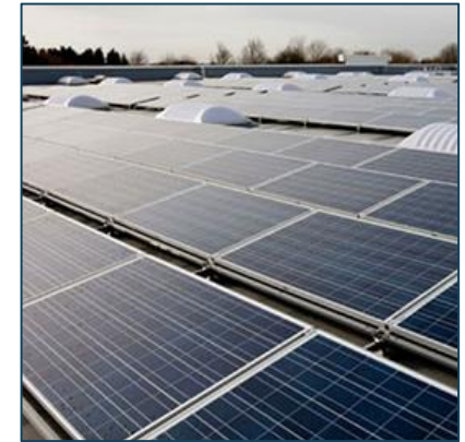
Pathway to Zero