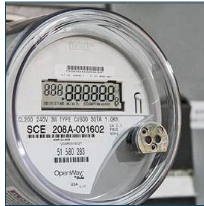
Metered Savings Program