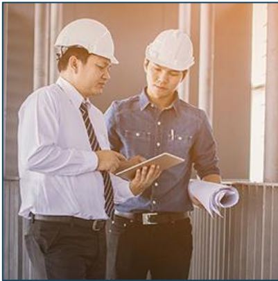
Project Delivery Program