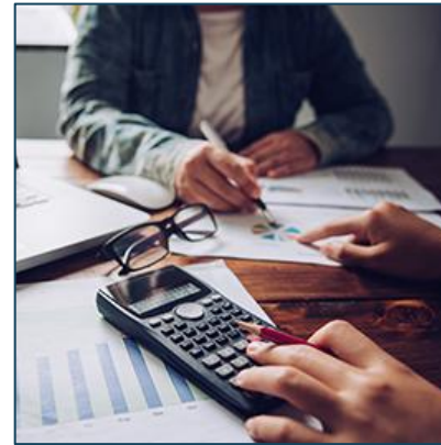
Revolving Loan Fund