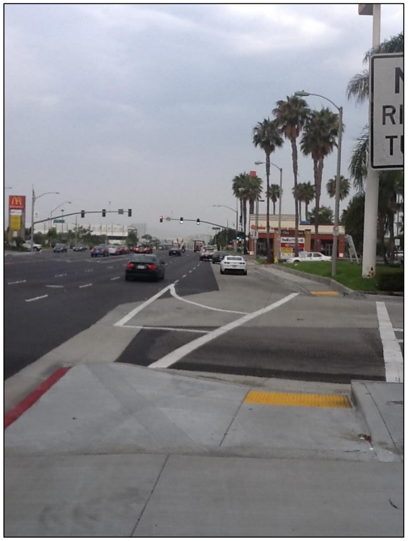
Project is complete! (North bound views of Rosecrans, west of I-405)