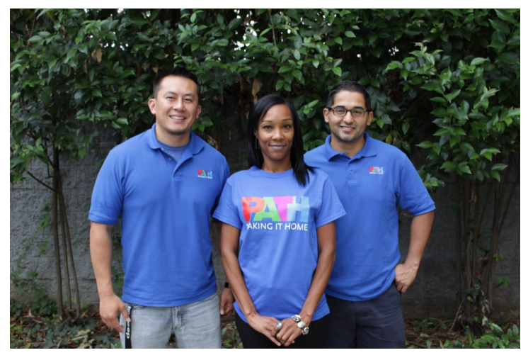
SBCCOG Outreach team